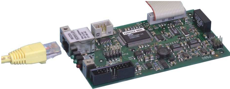
Card for inserting in power supply